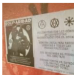
Wheatpaste & Spray Paint in