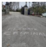
PITTSBURGH: Spray Paint at the