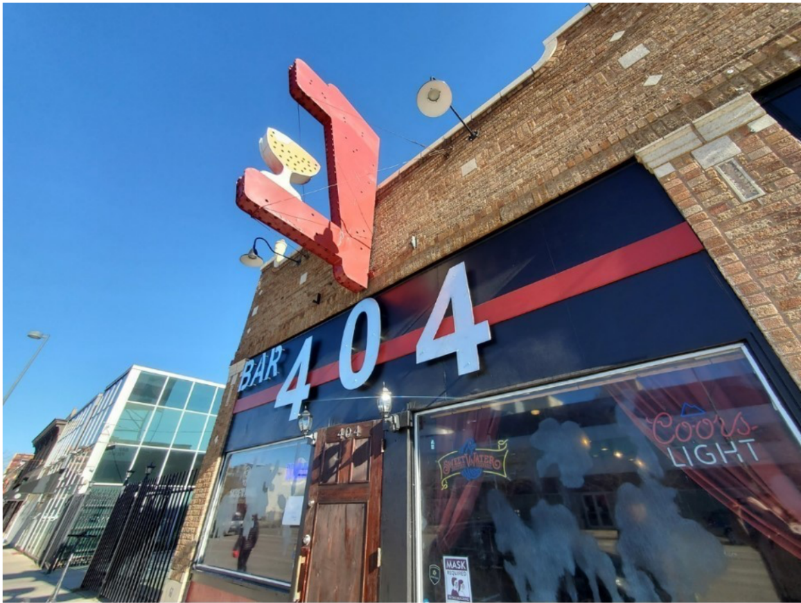
Bar 404's windows are damaged from spray paint that contained acid. Molly Martin

It costs around $200 to try and buff out this type of paint, but often the process leaves the glass foggy or does not erase the work at all. Businesses are then left to decide whether they want to drop over $500 on window replacements, or leave the damage as is.