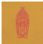
B. Traven For Beginners