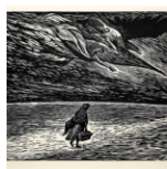
B. Traven For Beginners