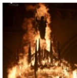
Christian Anarchism for