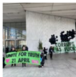
CORRUPT AS FUCK: Extinction