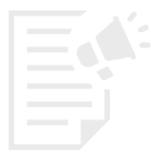
Anonymous activists spray