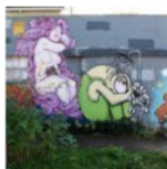
Spray Paint & Patriarchy: An