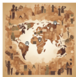
Add a Location to A Radical Guide: